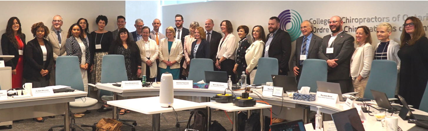
HPRO welcomed Deputy Premier and Health Minister Sylvia Jones to its Annual Meeting, held at the College of Chiropractors of Ontario (and by Teams virtually) on June 3, 2024.

HPRO is able to do its work through the dedication of exceptional volunteers, including all College Registrars who make up the Board of Directors. Sincere appreciation is extended to our Officers and Board members and our Committee members and chairs, Network leads, and all who share their expertise. HPRO is staffed by a full-time Executive Director and other HPRO team members—more about our volunteers and support team on the pages that follow.